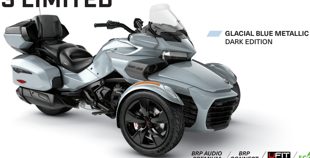
GLACIAL BLUE METALLIC DARK EDITION

BRP AUDIO PREMIUM / BRP CONNECT / UFIT / ECO