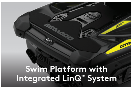
Swim Platform with Integrated LinQ™ System

The industry's first manufacturer-installed, truly waterproof, Bluetooth ® audio system.