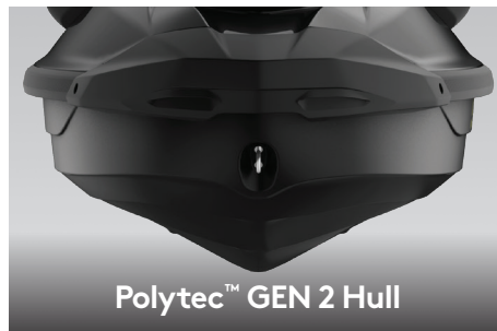
Polytec™ GEN 2 Hull

Exclusive quick-attach system on a large swim platform that allows for easy installation of storage accessories.