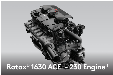
Rotax® 1630 ACE™ - 230 Engine 1

This powerful engine comes standard with a supercharger and external intercooler. It is optimized to run on regular fuel, which lowers fuel costs.