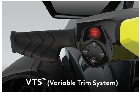
VTS™ (Variable Trim System)

This powerful engine comes standard with a supercharger and external intercooler. It is optimized to run on regular fuel, which lowers fuel costs.