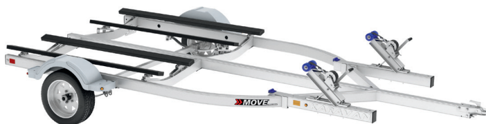
Aluminum MOVE II