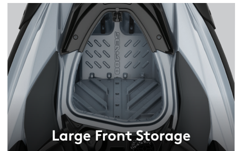
Large Front Storage

Specifically designed to meet the needs of recreational riders, the Polytec GEN 2 material is highly robust and scratch resistant, and reduces overall vehicle weight to improve efficiency.