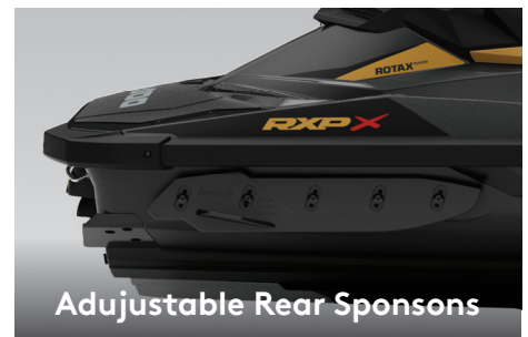
Adjustable Rear Sponsons

Limits bow rise and improves performance in all water conditions.