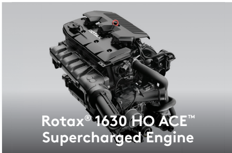
Rotax® 1630 HO ACE™ Supercharged Engine

The Rotax® 1630 HO ACE™ Supercharged is the most powerful Rotax® engine ever, delivering high efficiency and the best-in-class acceleration.