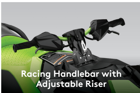
Racing Handlebar with Adjustable Riser

A narrow seat profile with deep knee pockets lets riders sit naturally and use the leg muscles to hold onto the machine for more control.