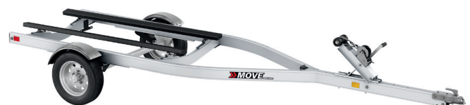
Aluminum MOVE I Extended 1250