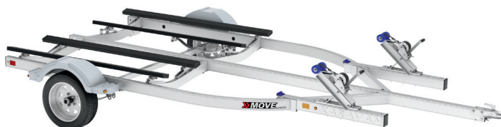
Aluminum MOVE II