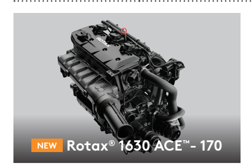
The new Rotax® 1630 ACE ^{\text{\tiny TM}} - 170 is the most powerful naturally aspirated Rotax engine ever on a Sea-Doo watercraft.