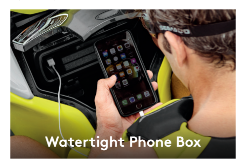
Waterproof and shockproof compartment specifically designed for phone protection.2