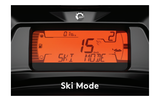
Five preset acceleration profiles make it easy to deliver a smooth launch and maintain consistent pace.