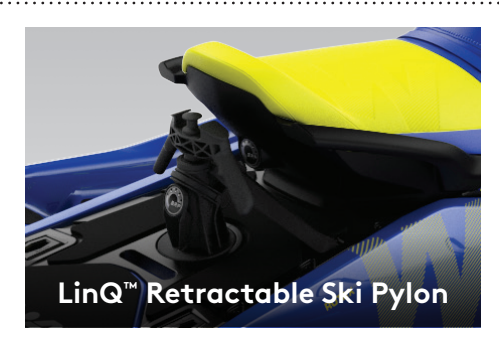
A quick-install retractable ski pylon that stows away when not in use. Features spotter handgrips and rope storage.