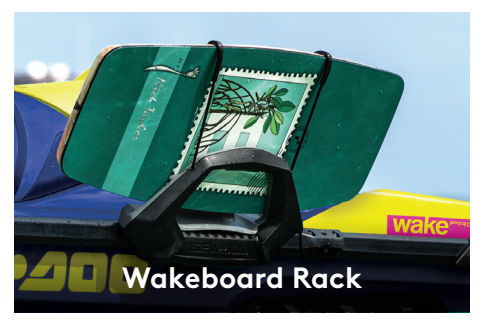
Provides easy wakeboard transport.1