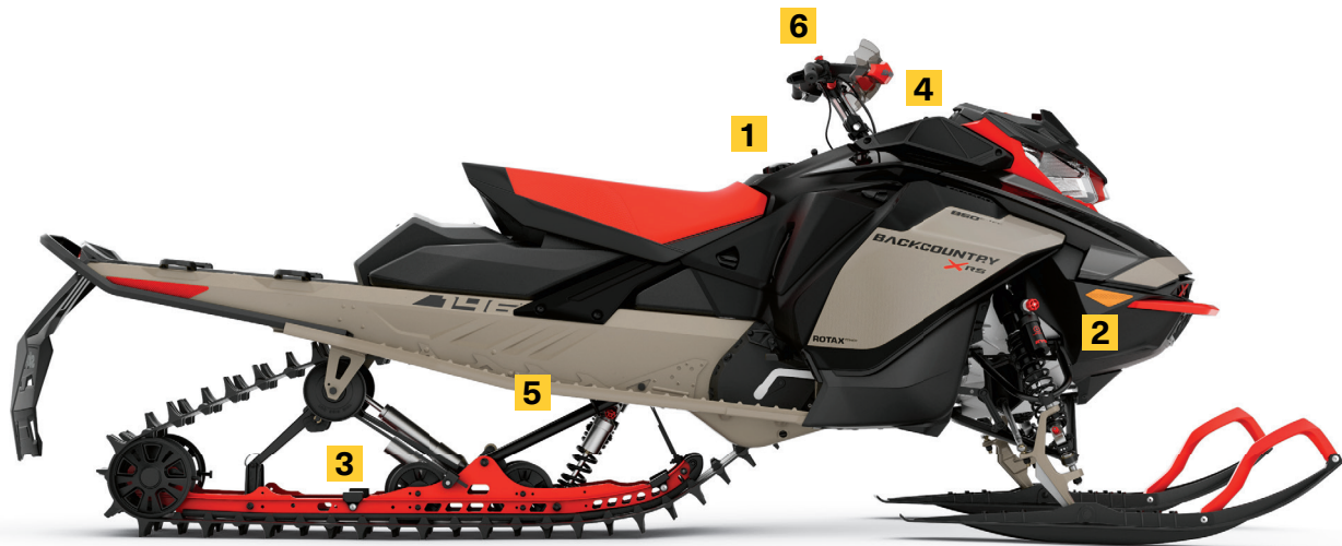
BACKCOUNTRY™ X-RS® 146 850 E-TEC® SHOWN

Crossover-specific suspension uses best principles of the rMotion™ trail and tMotion™ mountain skids for confident cornering and agile boondocking.