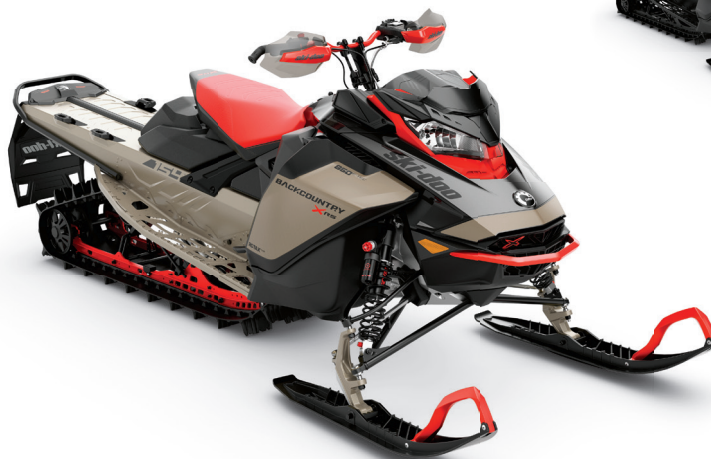
BACKCOUNTRY™ X-RS® 154 850 E-TEC® SHOWN

The most aggressive crossover vehicle with snocross attitude and go-anywhere capability.