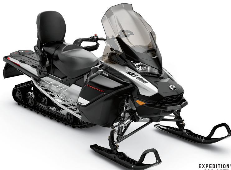
EXPEDITION® SPORT 900 ACE™ SHOWN

Ultra-responsive chassis for on- or off-trail rides and extensive array of sport-utility and 2-up features.